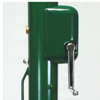
Gear Housing Cover