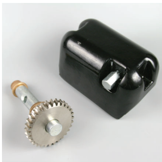
Plated Steel Gears