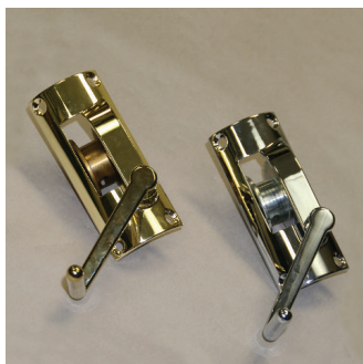
Flush mounted gear plate covers