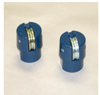
Die cast zinc caps