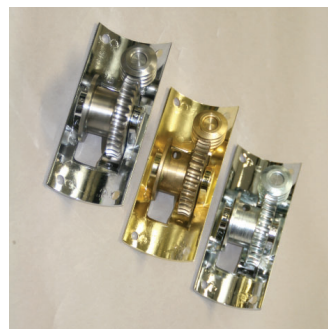
Die-cast zinc gear housings