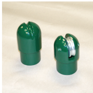
Cast Alluminum Allow Caps