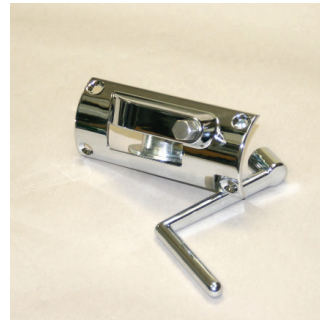
Plated Steel Hardware