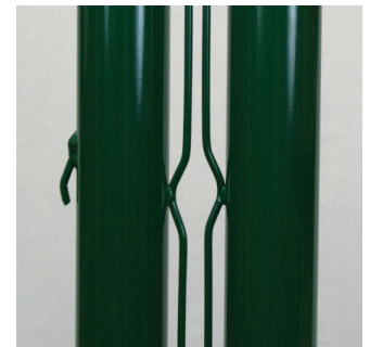
Integrated Welded Lacing Rods