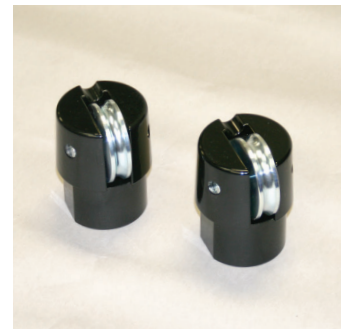
Die cast zinc caps