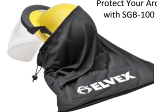
Protect Your Arc Kit with SGB-100 Bag