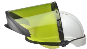
CU-Arc 6 Center Position Shown