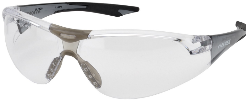
Clear with Black Temples

Our “Flagship” unitary lens spectacle with premium comfort and performance.