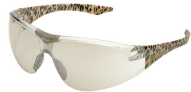
Indoor/Outdoor Leopard Temples