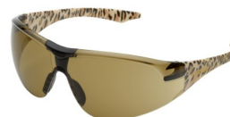
Brown NEW Leopard Temples