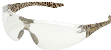
Clear with Leopard Temples