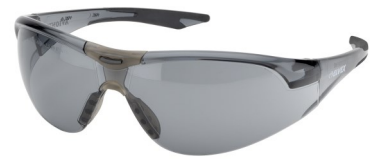
Grey AF with Black Temples