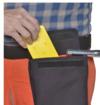
New Productivity Pocket. Stores wedges and wrench.