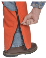
Zippers for Quick Donning. No hanging straps.