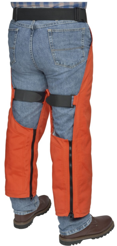
Full wrap-around calf protection with patented asymmetrical design for added protection. (U.S. Patent No. 5,095,544). Heavy-duty 1,000 Denier, water and oil resistant.