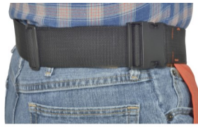
Self-Storing Waist Belt. Eliminates loose end catch points Adjusts up to 50".