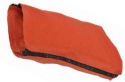
Self-Storing Feature-Fold down chaps to fit into one leg and zip closed. Easy to store and carry.