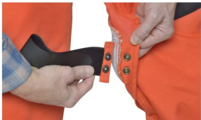
Replaceable Velcro® Thigh Closures. Available in 3 sizes: JE-LEGZ8 (8"), JE-LEGZ12 (12") and JE-LEGZ16 (16").