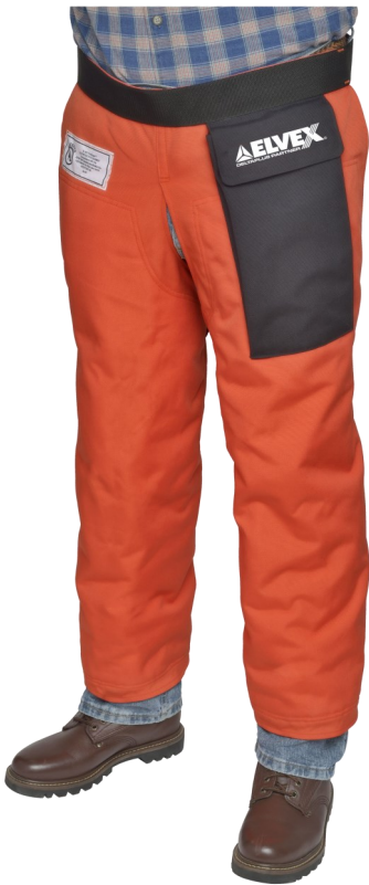
Available in 33", 36" & 39" lengths measured from waist.

New and Improved ProChapsZ™! Designed with quick donning zippers, adjustable Velcro® leg closures for reduced catch points, greater safety and hassle-free wear!