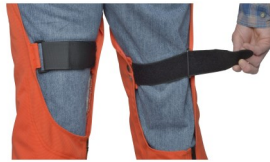
Replaceable Velcro® Thigh Closures for sleek fit and reduced catch points.