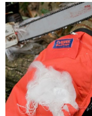
Exclusive Prolar™ protective padding for quick chain stopping!