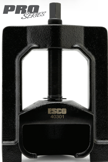
MODEL 40301 Medium Duty U-Joint Puller