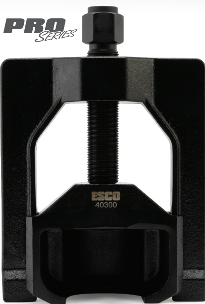
MODEL 40300 Heavy Duty U-Joint Puller

Eliminate the use of dangerous vice-and-socket or hammering methods.