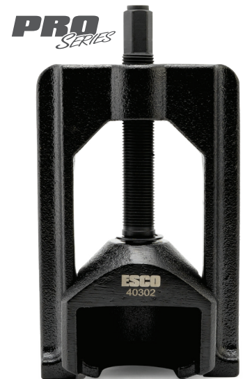
MODEL 40302 Automotive U-Joint Puller