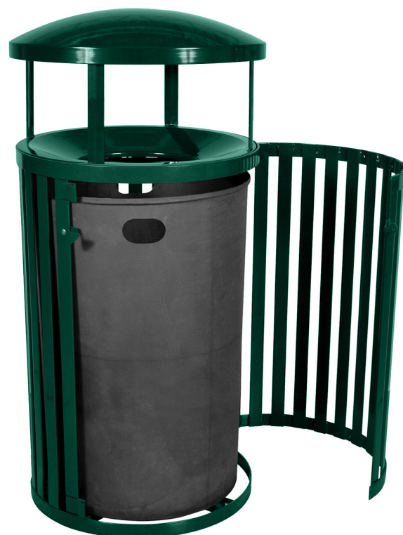
SCTP-40 D HGR