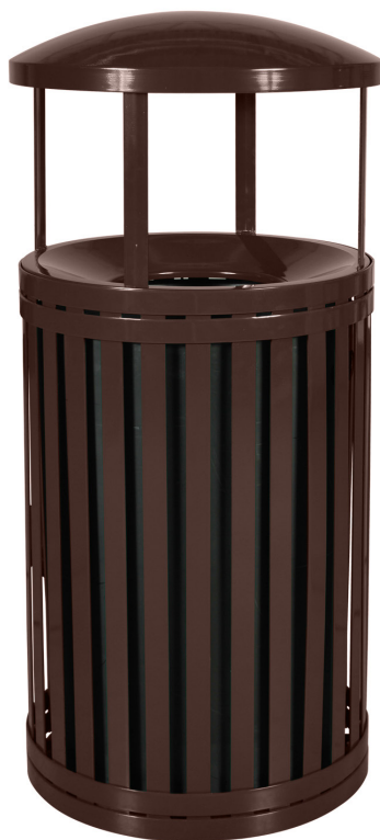
SCTP-40 D ND COF