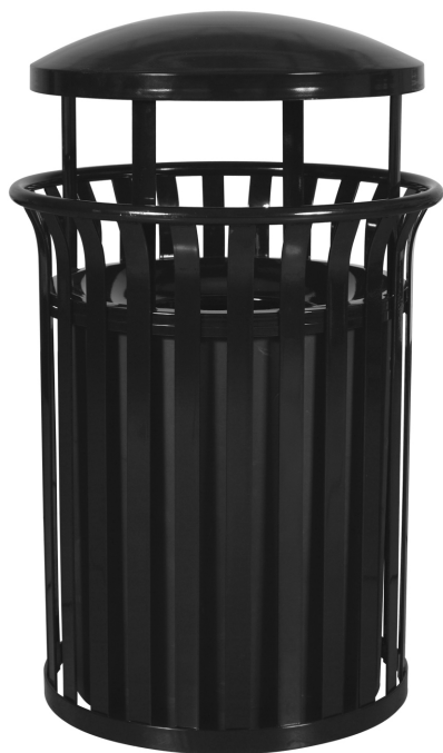
CLASSIC: SCD-2633 BLK