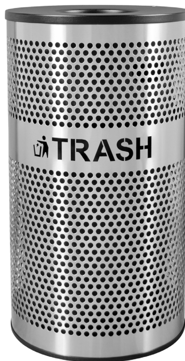
VCT-33 PERF SS

Unlike similar receptacles, the Venue Series features laser cut RECYCLE or TRASH in the center of the body (other units use decals). These units also feature color coordinated plastic liners.