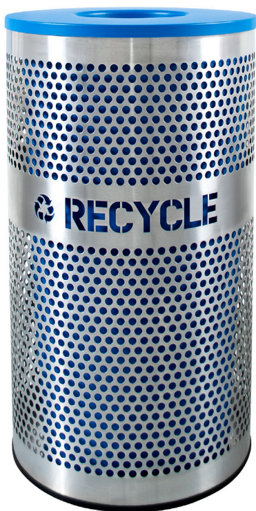
VCR-33 PERF SS