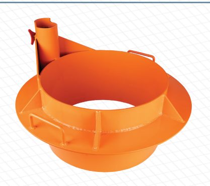
650124MH Manhole Collar features lightweight powder coated aluminum construction and integral handles; fits manholes from 22" to 24" in diameter.