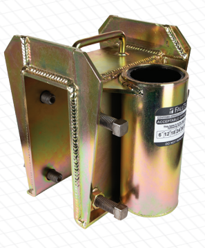
65012F Barrel Mount base features plated steel construction for structures up to 3\frac{1}{2} " thick