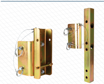
65105D and 65106M Brackets adapt DBI and Miller winches and SRL-R devices to FallTech Davits