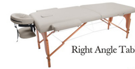
Right Angle Table