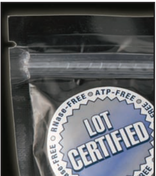
All CryoClear™ cryogenic vials are sold in tamper evident, resealable plastic bags. 50 vials per bag, 10 bags per case.