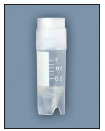
Item# 3010 (shown actual size)