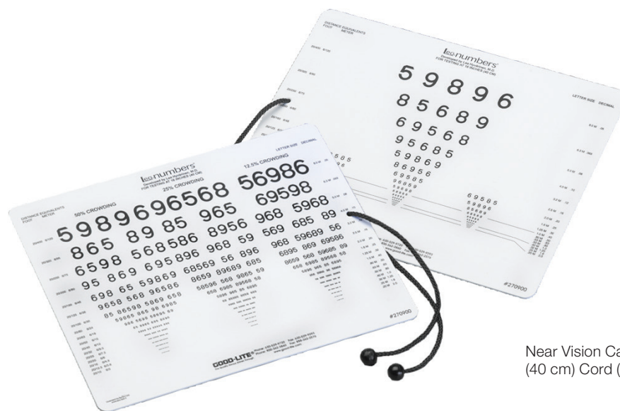
Near Vision Card with 16" (40 cm) Cord (#270900)