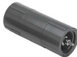
Fipt x Fipt