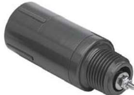
Mipt x Fipt