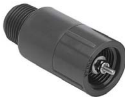
Fipt x Mipt