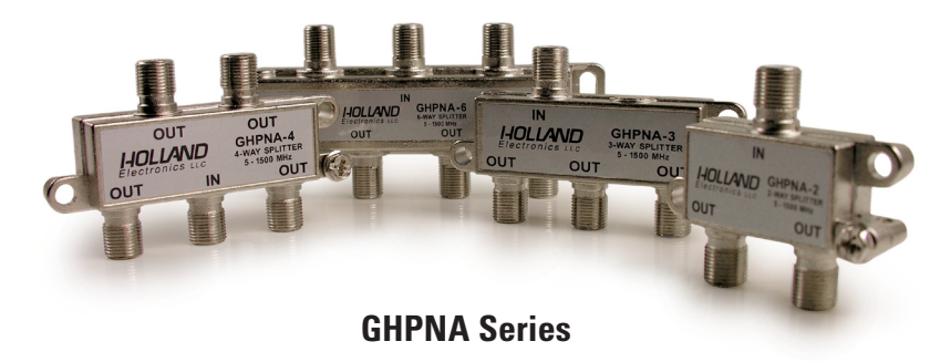
2-way, 3-way, 4-way and 6-way splitters

The Holland GHPNA-* splitters have been specifically designed to work in HPNA environments. The low port to port isolation allows HPNA communication signals to pass through the splitters to set top boxes with as little signal loss as possible. At the same time the GHPNA Series splitters provide good return loss and isolation for in band frequencies other than HPNA.