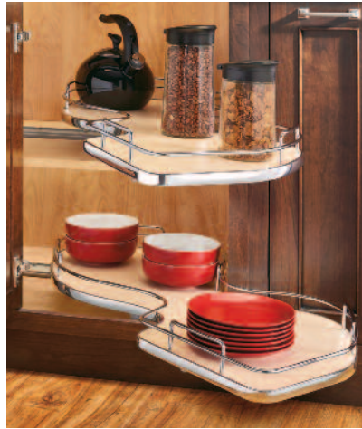
RS5372 Double Tier