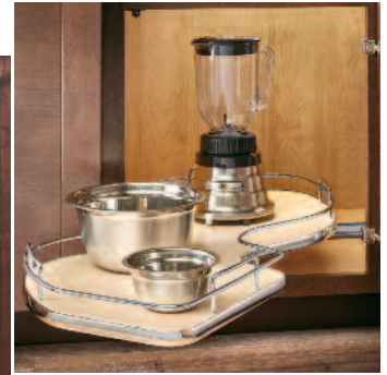
RS5371 Single Tier