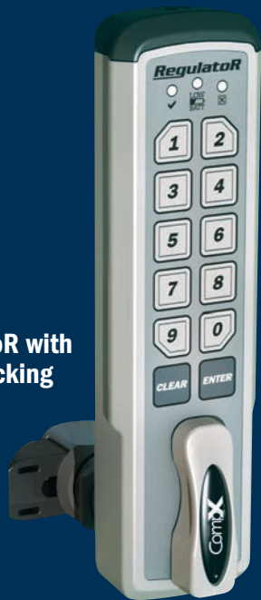
Regulator with self-locking