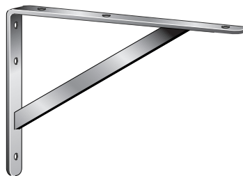
208 Series Ultimate L-Bracket™