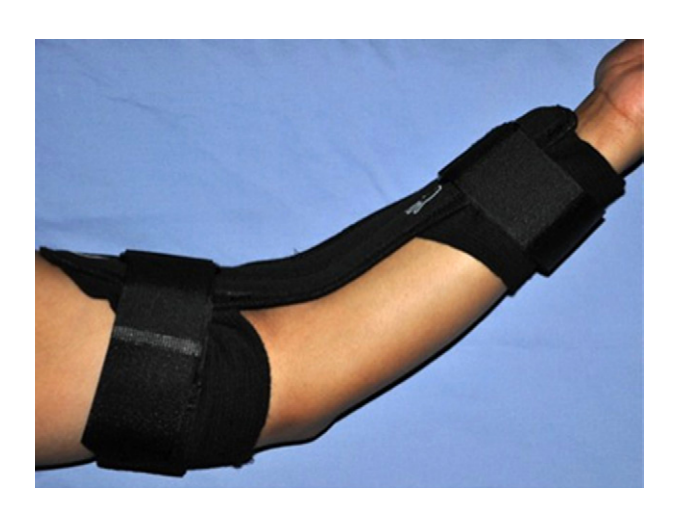
FIGURE 1: Hely & Weber orthosis used in this investigation. The orthosis can be adjusted to keep the elbow at 45° of flexion.

time aggravation of the ulnar nerve (Appendix A; available on the Journal's Web site at www.jhandsurg.org).