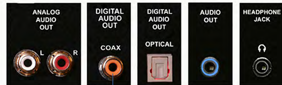
Color May Vary

You Only Need One Of These Five Possible Options. Using the headphone jack may turn off the TV speakers.