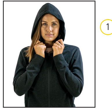
HIGH-QUALITY FABRIC Made with comfortable, midweight fabric that makes it great for swim meets and daily use (Outer: Cotton/Polyester Blend, Inner: Polyester)

Designed to outfit athletes and coaches for travel and competition.