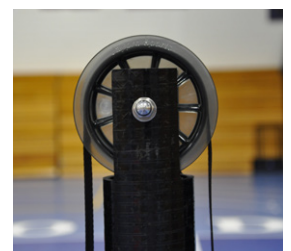
Recessed Pulley Wheel