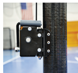
Uprights with Winch