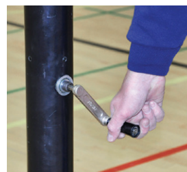
Infinite Height Adjustment