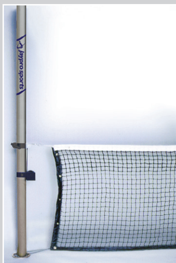
Adjusted for tennis