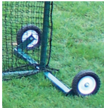
Shown with optional wheel kit