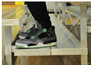
Double Foot Plank

ALL ALUMINUM STANDARD BLEACHER ALL ALUMINUM PREFERRED BLEACHER STANDARD OUTDOOR BLEACHER ENCLOSED BLEACHER