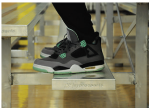
Single Foot Plank