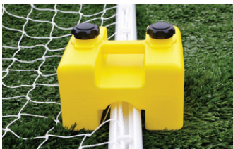
World Cup™ anchors