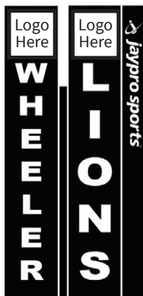
Side 1 Side 2