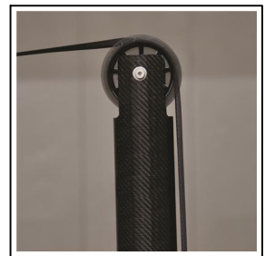
4" DIAMETER POLYCARBONATE PULLEY WHEEL

PVB-9000 Carbon Volleyball 3-1/2" System