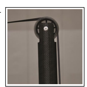
4" DIAMETER POLYCARBONATE PULLEY WHEEL