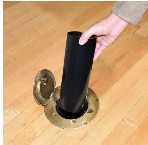
EXAMPLE OF PROPER USE