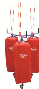
SHOWN w/ NET STORAGE BAGS (SOLD SEPARATELY P/N: VNKBAG)