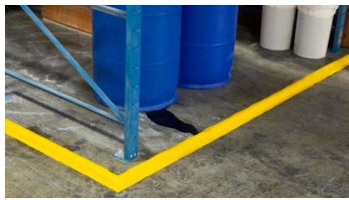
Make-A-Berm contains oils, gasolines, acids and other liquids.

For further info call 1-800-798-9250 or visit us online at Justrite.com