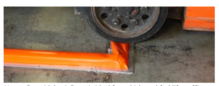
Heavy-Duty Make-A-Berm is ideal for vehicle and forklift traffic.