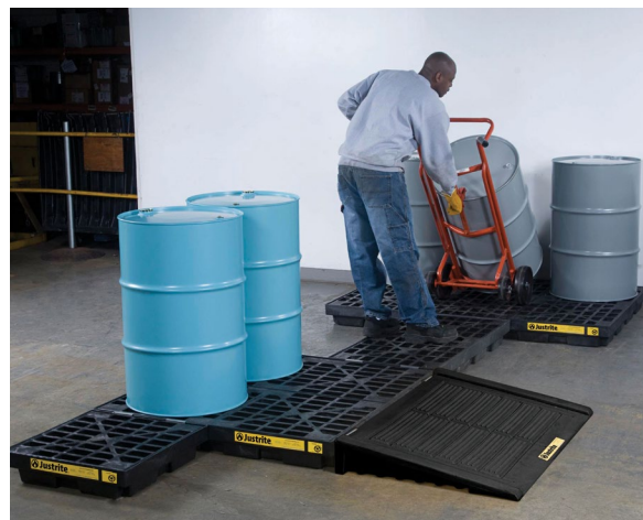
Modular design lets you join centers together to fit your space and application.