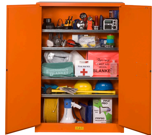
Contents not included

PowerPort™ model (860002) has an installed electrical pass-through connection and comes with external power cord and 10 amp rated, 6-outlet power strip for charging walkie talkies, flashlights, etc. inside the cabinet.