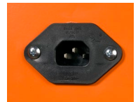
PowerPort™ charges equipment for always-ready use.