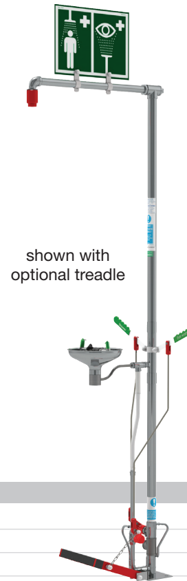
shown with optional treadle

Self-draining emergency safety shower with open 316L stainless steel eye/face wash, suitable for hot climates. The design allows standing water to drain away from the standpipe to ensure the delivery of tepid water. The valve is situated directly above the water inlet; the bleed pipe is fitted above this so standing water can drain into the ground, preventing stagnant water overheating from solar radiation and removing the risk of further injury to the operator. Available with galvanized mild steel or stainless steel pipework. Includes universal eye wash and shower sign for enhanced visibility. ANSI compliant.