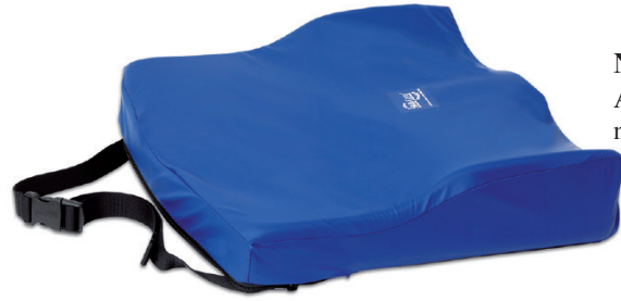
New Visco Anti-Thrust Cushion model# 753160