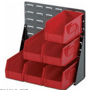
LPA1818-CST Shown with PB105-5