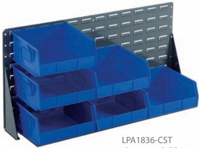
LPA1836-CST shown with PB1011-5

Organize your workbench with LEWISBins+ easy-to-assemble Bench Assemblies. Durable Louvered Panels are accompanied by 16-gauge steel legs that can be added with fasteners. Pre-configured systems with bins are available or bins can be ordered separately. Louvered Panel Bench Assemblies hold 100-130 lbs.