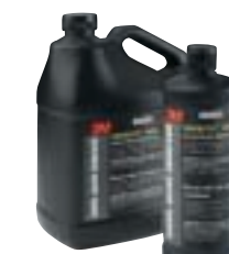
PN 06065 / 06064 Gallon / Quart 3M™ PERFECT-IT™ 3000 SWIRL MARK REMOVER