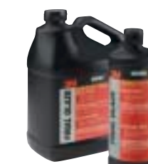
PN 06067 / 06066 Gallon / Quart 3M™ PERFECT-IT™ 3000 FINAL GLAZE