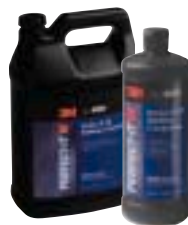
PN 05934 / 05933 Gallon / Quart 3M™ PERFECT-IT™ III RUBBING COMPOUND