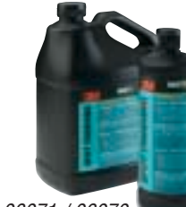
PN 06071 / 06070 Gallon / Quart 3M™ PERFECT-IT™ 3000 TRIZACT™ SPOT FINISHING MATERIAL