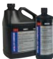
PN 06061 / 06060 Gallon / Quart 3M™ PERFECT-IT™ 3000 EXTRA CUT RUBBING COMPOUND