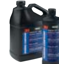
PN 06063 / 06062 Gallon / Quart 3M™ PERFECT-IT™ 3000 RUBBING COMPOUND