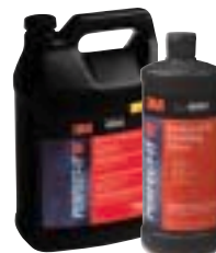
PN 05943 / 05941 Gallon / Quart 3M™ PERFECT-IT™ III FINISHING GLAZE