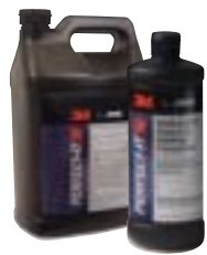
PN 05940 / 05936 Gallon / Quart 3M™ PERFECT-IT™ III EXTRA CUT RUBBING COMPOUND