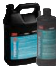
PN 05931 / 05930 Gallon / Quart 3M™ PERFECT-IT™ III TRIZACT™ MACHINE GLAZE