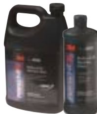
PN 05938 / 05937 Gallon / Quart 3M™ PERFECT-IT™ III MACHINE GLAZE