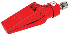
1/2 Ton Spreader Ram AES-65145