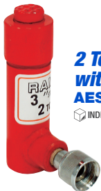
2 Ton Threaded Ram with 3" Stroke AES-80407