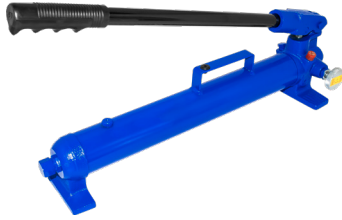
10 Ton Hand Pump AES-81101