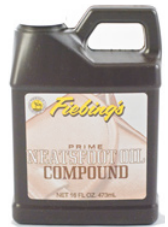
Neatsfoot Oil NF0-16 16 oz. Bottle

Original Mack Pinstriping Brush Assortment #10 Includes 1 each of Sizes 000, 00, 0, 1, 2 and 3