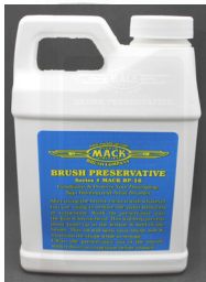
MACK BRUSH PRESERVATIVE MBP-16 16 OZ.