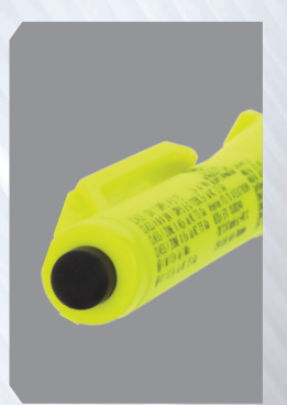
Push-button tail-cap switch