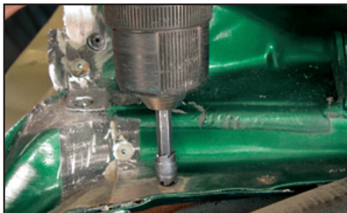
3/8" Double-End Replacement Spotweld Cutters Part No. 13214