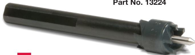
Blair Double-End Spotweld Cutter Part No. 13224

Blair Double-End Spotweld Cutters make removing body panels fast and easy. Their hollow design cuts around the spotweld so weld hardness does not affect tool sharpness. When one end becomes dull, simply unscrew the cutter and flip it over using the new teeth on the other side. An adjustable depth rod sets the tool so only the outer panel is cut, leaving the underlying panel undamaged. Made in USA. Replacement Parts: Arbor - 13216, Pilot - 13217.