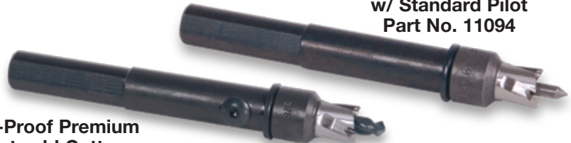
Skip-Proof Premium Spotweld Cutter Part No. 11093