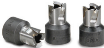
3/8" Premium Spotweld Replacement Cutters Part No. 11108-3

11094 Replacement Parts: Arbor - 11122, Pilot - 11121