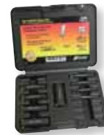
Molded Black Case