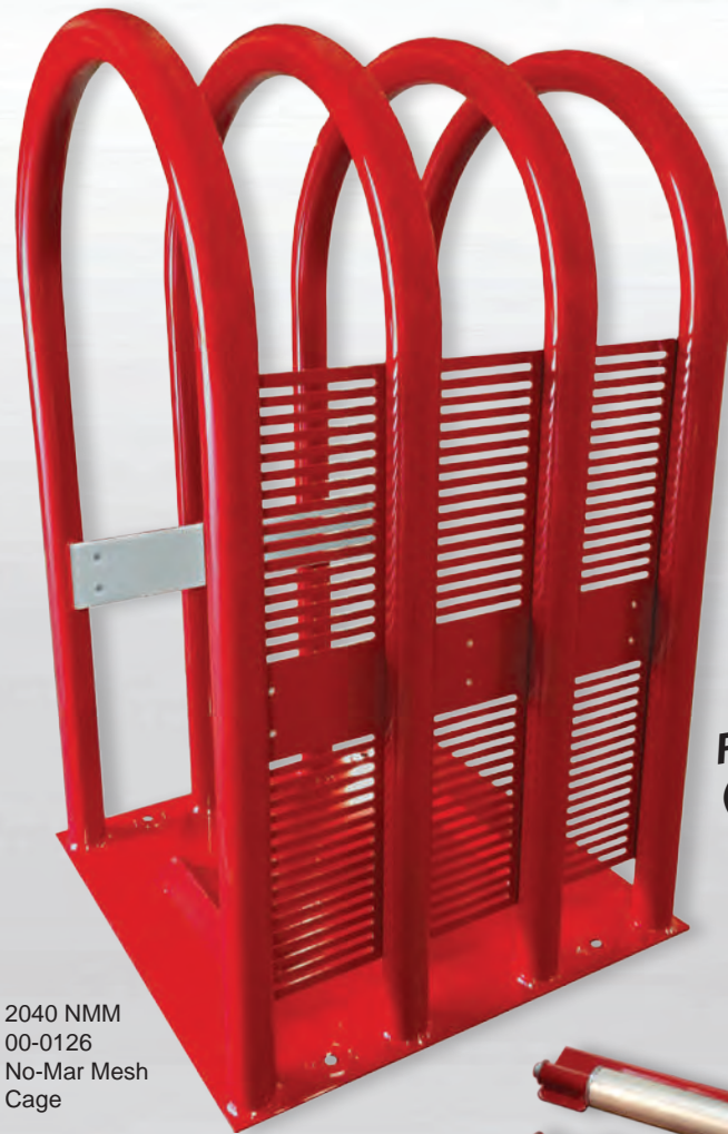
2040 NMM 00-0126 No-Mar Mesh Cage