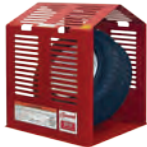
2010 Utility Tire 00-0166 Safety Cage