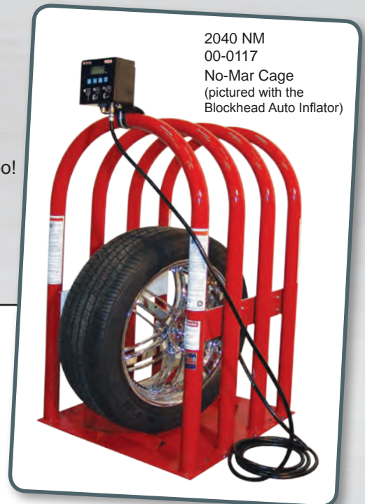
2040 NM 00-0117 No-Mar Cage (pictured with the Blockhead Auto Inflator)