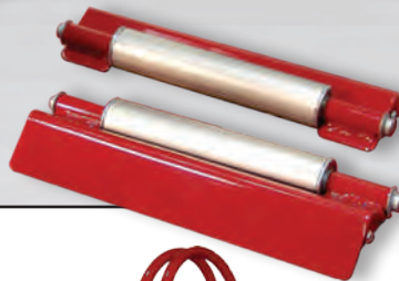
210 04-0184 Cage Rollers