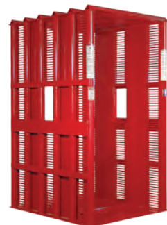
2264 Mesh 900-598