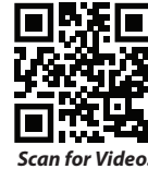
Scan for Video!