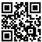
Scan for Video!

Removes glow plugs, even when compartment is not easily accessible, including narrow engine bays & engines w/ glow plugs on firewall side. Enables removal of broken glow plugs on top of cylinder head w/o damage. Includes (1) electrode puller, (1) electrode reinforced drill w/ (2) guides, (2) specially centered mills w/ one mill support preventing damage to head, (1) tap & (1) slide hammer extractor to pull out broken glow plugs, (3) refreshing taps sizes: M8, M10x100 & M10x125 w/ hex drive. Packed in blow mold case.