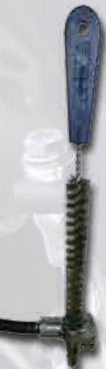
BS1 Professional Battery Brush