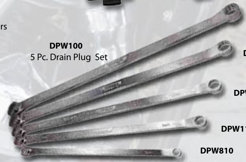
DPW100 5 Pc. Drain Plug Set