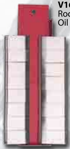
V16 Rocker Arm Oil Deflectors