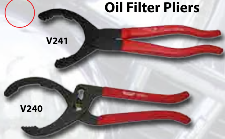
Oil Filter Pliers