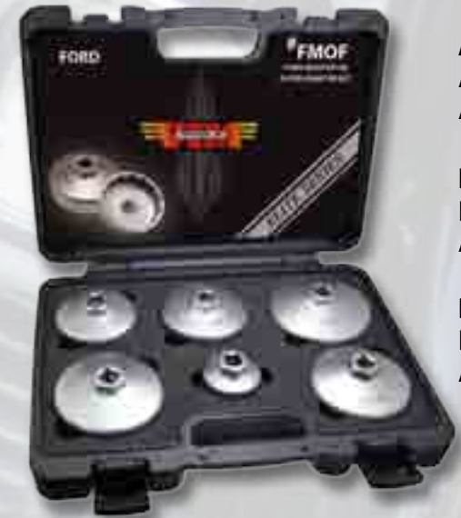
FORGED FILTER SOCKETS