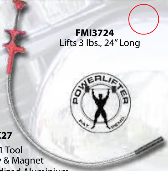
FMI3724 Lifts 3 lbs., 24" Long