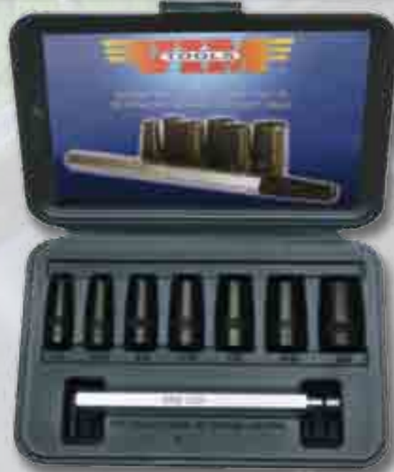
P79 Hollow Punch Set