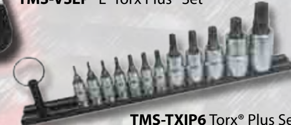
TMS-TXIP6 Torx® Plus Set