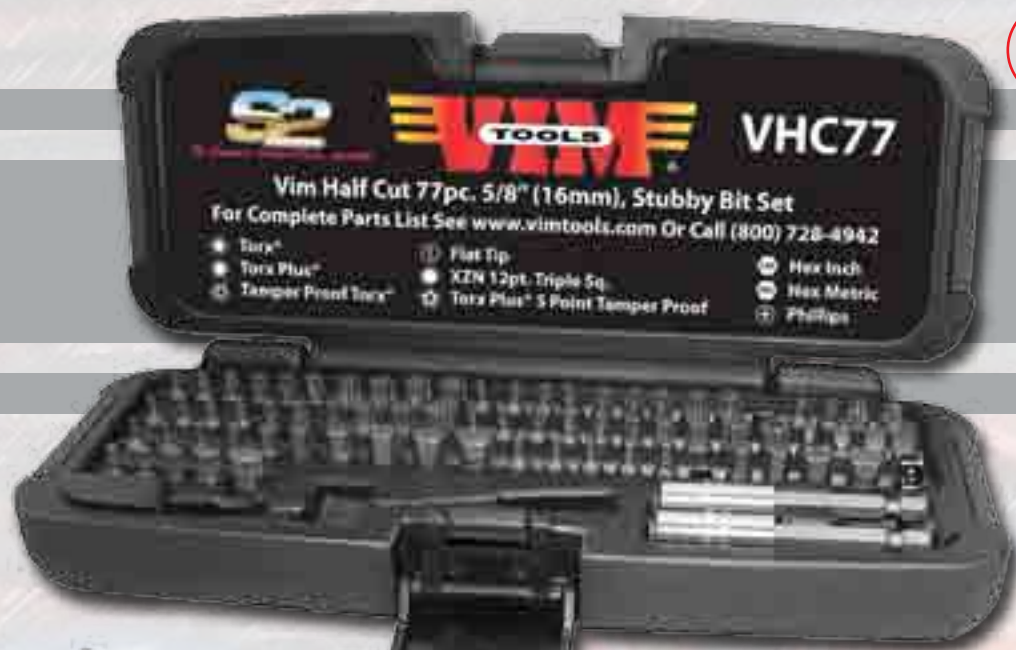
VHC77 Close Quarter Bits