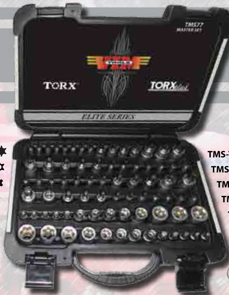
TMS77 Torx® Master Set