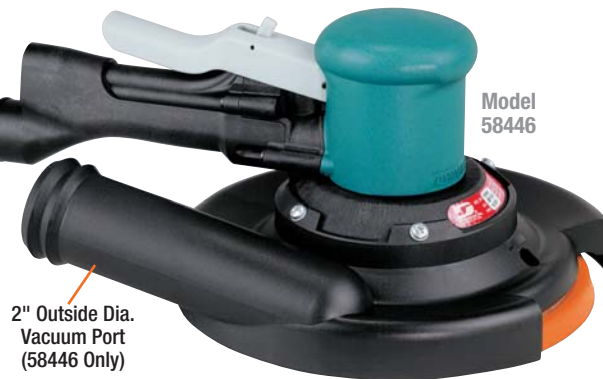
2" Outside Dia. Vacuum Port (58446 Only)